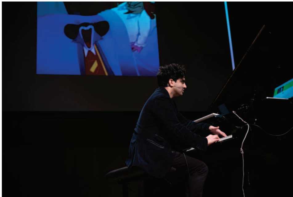
Fig. 6. Performing with the Tom and Jerry compilation, Sydney, 13 April 2019. (© Zubin Kanga. Photo: Chris Hayles.)