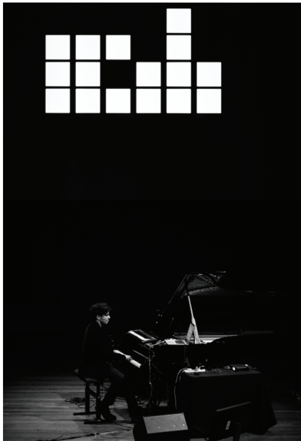
Fig. 3. Zubin Kanga performing WIKI-PIANO.NET in Sydney, 13 April 2019. (© Zubin Kanga. Photo: Chris Hayles.)

These devices all create coherence by categorizing widely varying input materials and mapping a single sound to each, thus exaggerating the similarities between seemingly diverse content. Schubert’s strategy was not just to create internal coherence but also to create an aesthetic coherence with