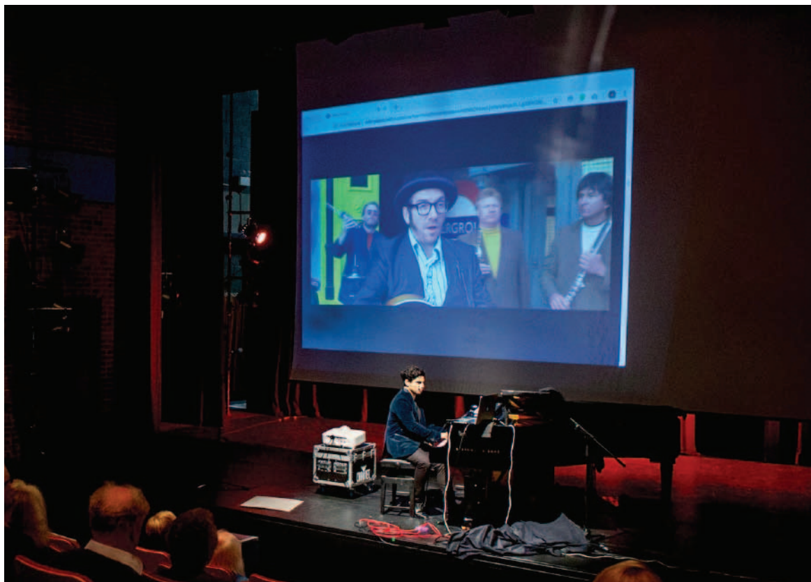
Fig. 7. Performing with Elvis Costello singing Burt Bacharach's "I'll Never Fall in Love Again" from the Cambridge Music Festival performance, 13 November 2019. (© Zubin Kanga. Photo: Marc Gascoigne.)